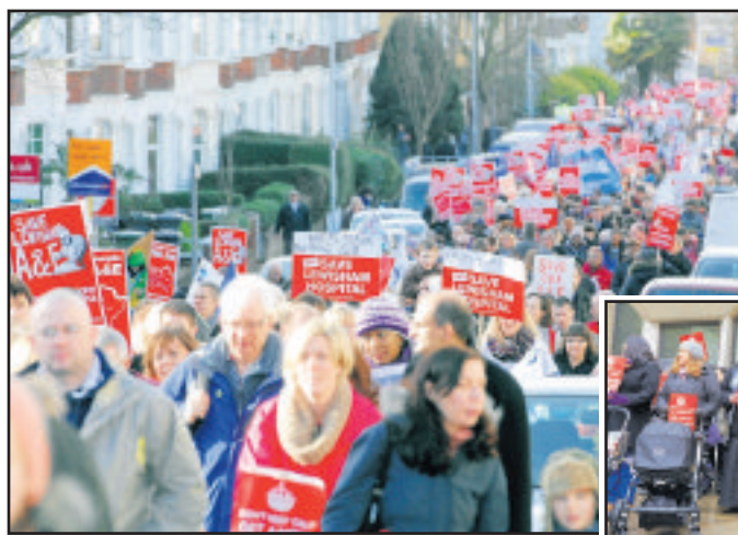
LEFT: The march held on Saturday and (inset below) mums and their children hold a protest at the Department of Health LC73555